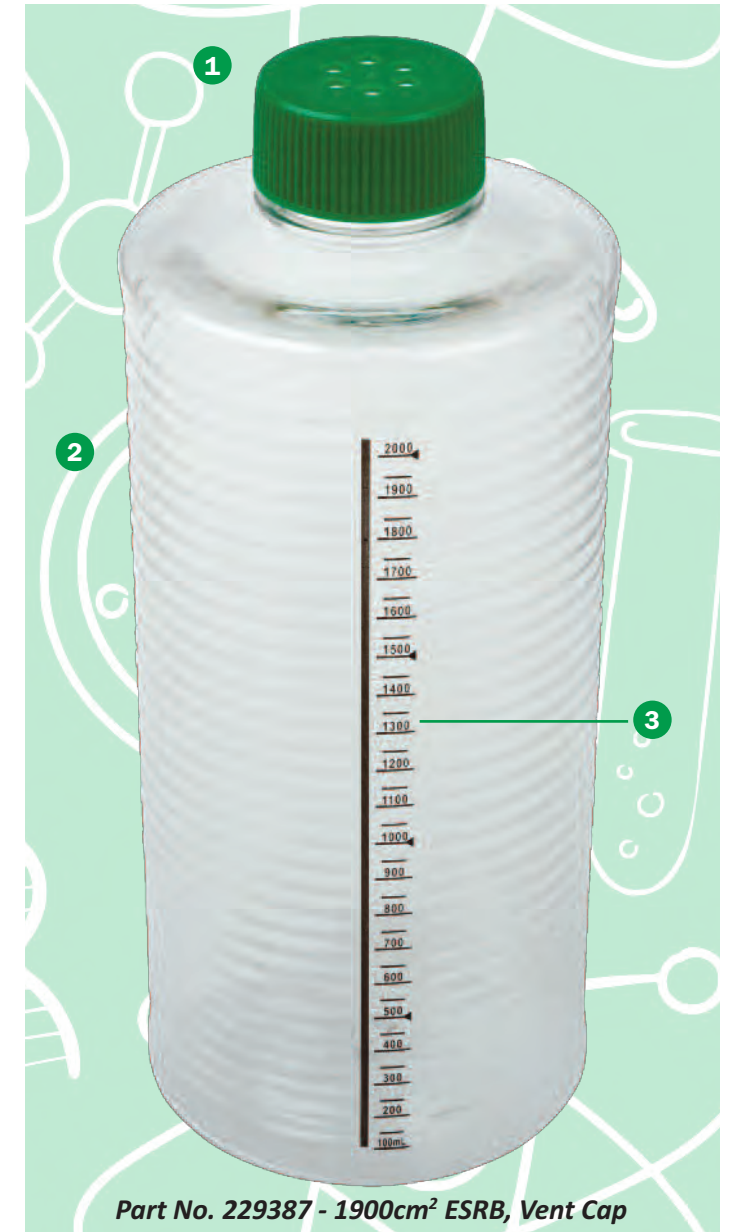
Part No. 229387 - 1900cm 2 ESRB, Vent Cap